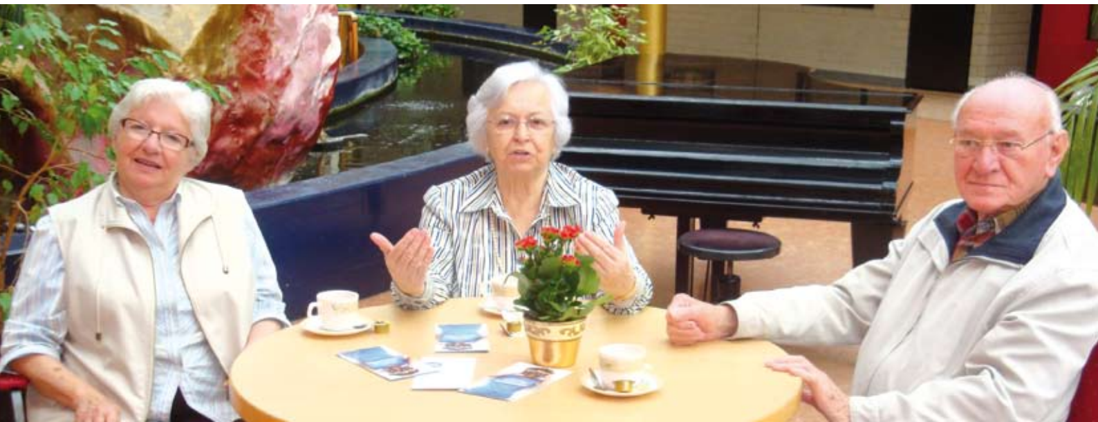
Residents of Apartments for Life in the Netherlands