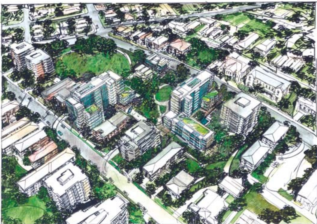
Artist's impression: Aerial view of site, Ocean Street side.