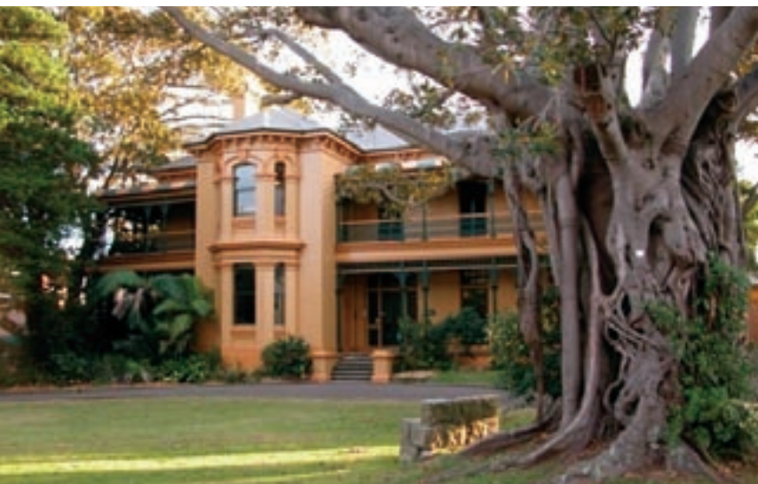
Heritage-listed Scarba House will undergo conservation work.

We believe that the project plan balances our goal to provide affordable and appropriate housing and care for older people, with an understanding of the importance to our neighbours of maintaining local amenity.