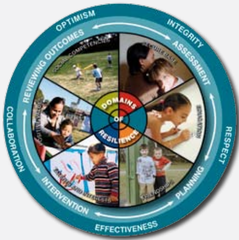
Figure 1: Domains of Resilience

The Benevolent Society uses the ‘domains of resilience’ model as a means of conceptualising each of three aforementioned basic building blocks. The model is used in combination with an ecological framework that demonstrates the levels at which resilience factors can be located.